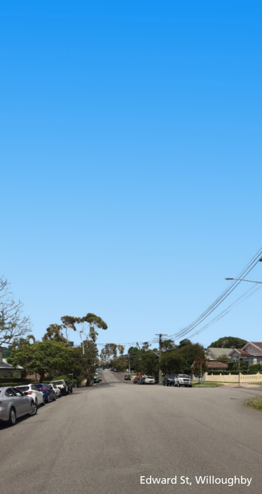
Edward St, Willoughby