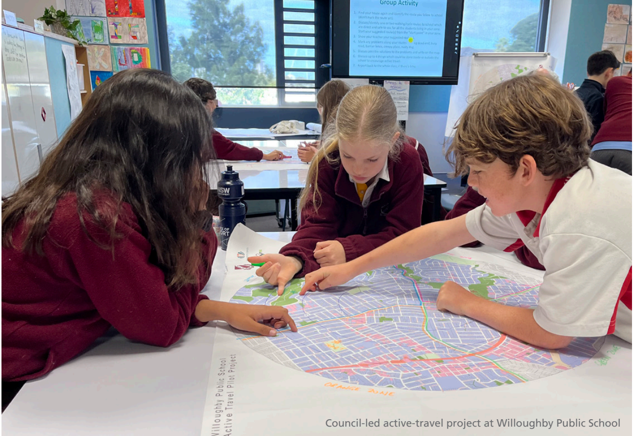
Council-led active-travel project at Willoughby Public School