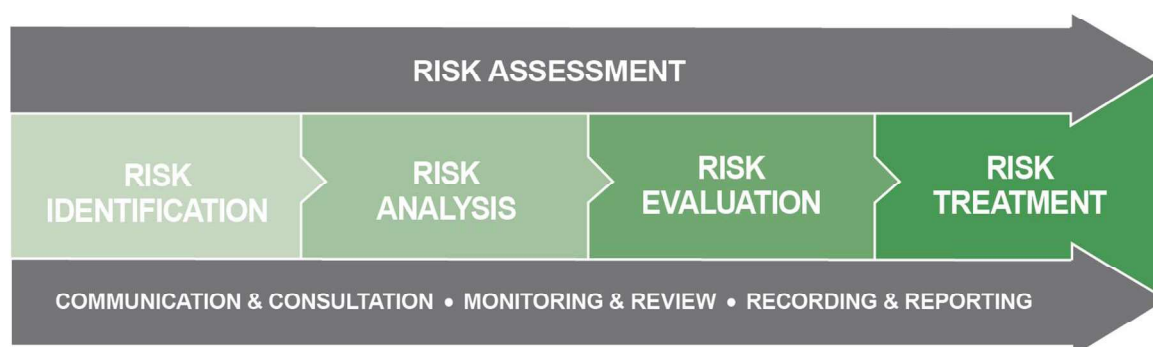
Figure 1: Overview of the risk assessment process

The Australia/New Zealand Standard AS/NZS 31000: 2018 Risk Management was used to guide the bush fire risk assessment process. This is outlined in Figure 1 below.