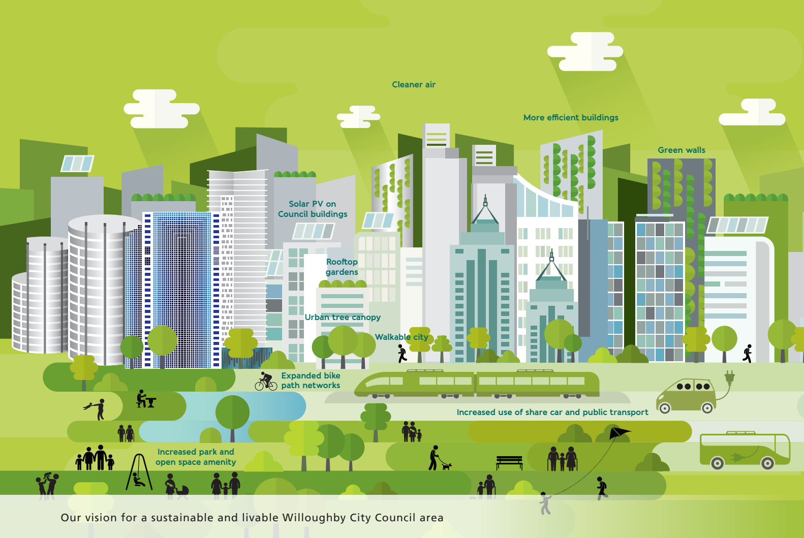
Our vision for a sustainable and livable Willoughby City Council area